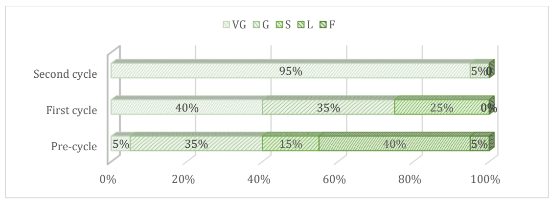
Fig. 2. Student CLA categories

It appears in figure 1 that there are differences in pupils that pass in each measurement. As many as 70% of pupils fail in learning, and only 30% are successful in the initial measurement. After implementing the action with CTL in the first cycle, it was found that there was an increase of 20% of successful pupils. In this cycle the pass pupils reached 50:50 with pupils which did not pass. The perfect achievement in the second cycle was found that 100% of the pupils were successful. No pupils fail to reach the specified standard. The categories of CLA pupils are shown in Figure 2.